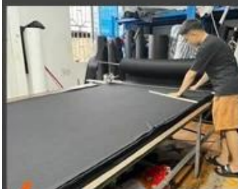
05 Fabric cutting