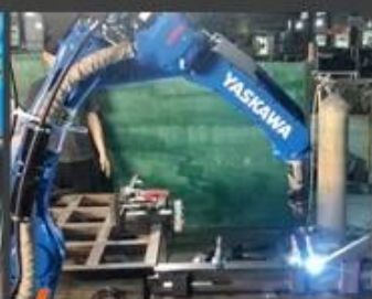
03 Robot system