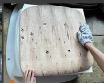
04 Foam sticking