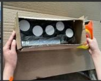
11 Fitting packing