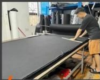
05 Fabric cutting