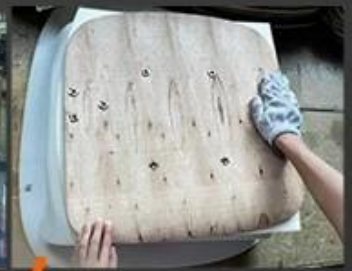
04 Foam sticking