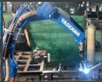
03 Robot system