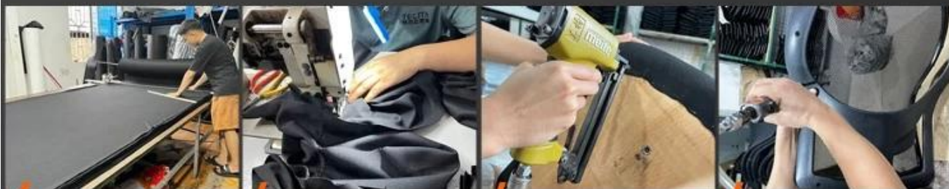
05 Fabric cutting